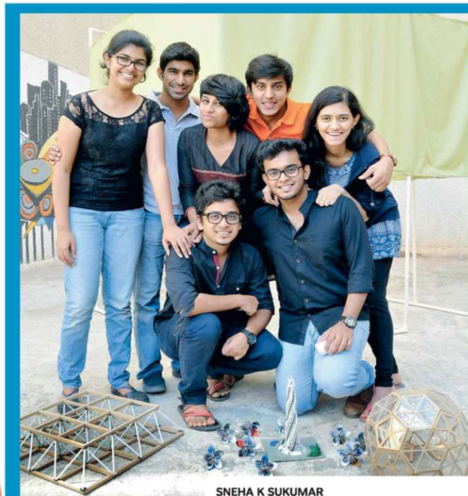
A file picture for representational purposes only